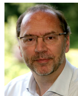
Flanders native, Dr Peter Piot, was Executive Director of UNAIDS from its creation in 1995 until the end of 2008.

Estimates show that around half of all sex workers in Eswatini, Lesotho, Malawi, South Africa and Zimbabwe are living with HIV. In South Africa, UNAIDS reviews and provides direct inputs into the National Sex Worker HIV Plan to ensure equal access to health and legal services for sex workers. UNAIDS also supports civil society AIDS responses with their target achievement, data collection and reporting, and linkages with other programmes and campaigns. Finally, UNAIDS works closely with sex worker organizations and supports their participation in national, regional and global consultations and fora.