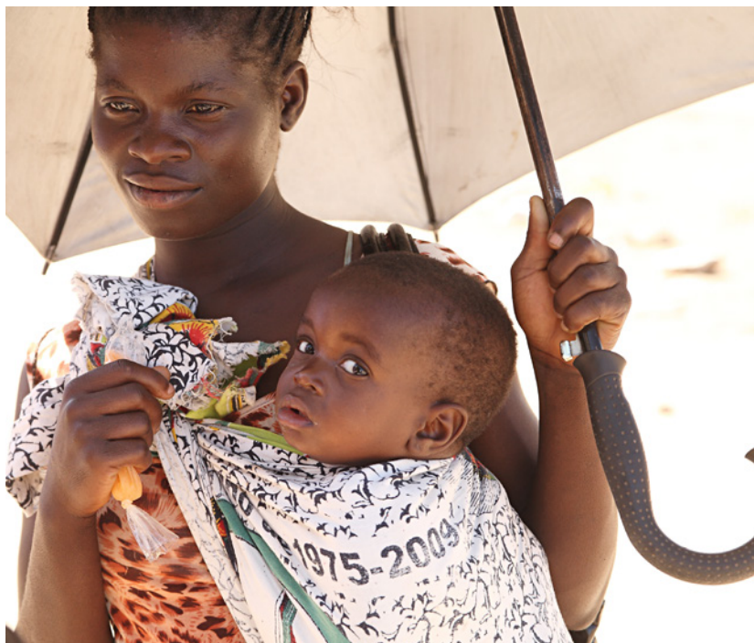
Adolescent mother, stakeholder of the Flemish Development Cooperation – Tete, Mozambique.

To address this imbalance, UNAIDS has developed the HIV Gender Assessment Tool , a detailed plan to support countries to assess their HIV epidemic, context and response from a gender perspective. This multipartner process allows countries to identify gaps, develop gender-specific programmes and policies, and include key recommendations in national strategic plans, country investment cases and submissions to the Global Fund to Fight AIDS, Tuberculosis