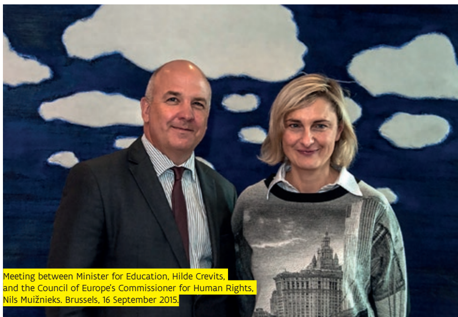
Meeting between Minister for Education, Hilde Crevits, and the Council of Europe's Commissioner for Human Rights, Nils Muižnieks. Brussels, 16 September 2015.

In addition, in the care innovation policy, the person with a disability slowly but surely assumes control over his own life and progress is made with person-linked financing. This was introduced with the Decree of 25 April 2014 concerning the person-linked financing for persons with a disability and to the reform of the way of funding the care and the support for persons with a disability (hereinafter “Decree on person-linked financing”). This principle assumes a request-driven support.