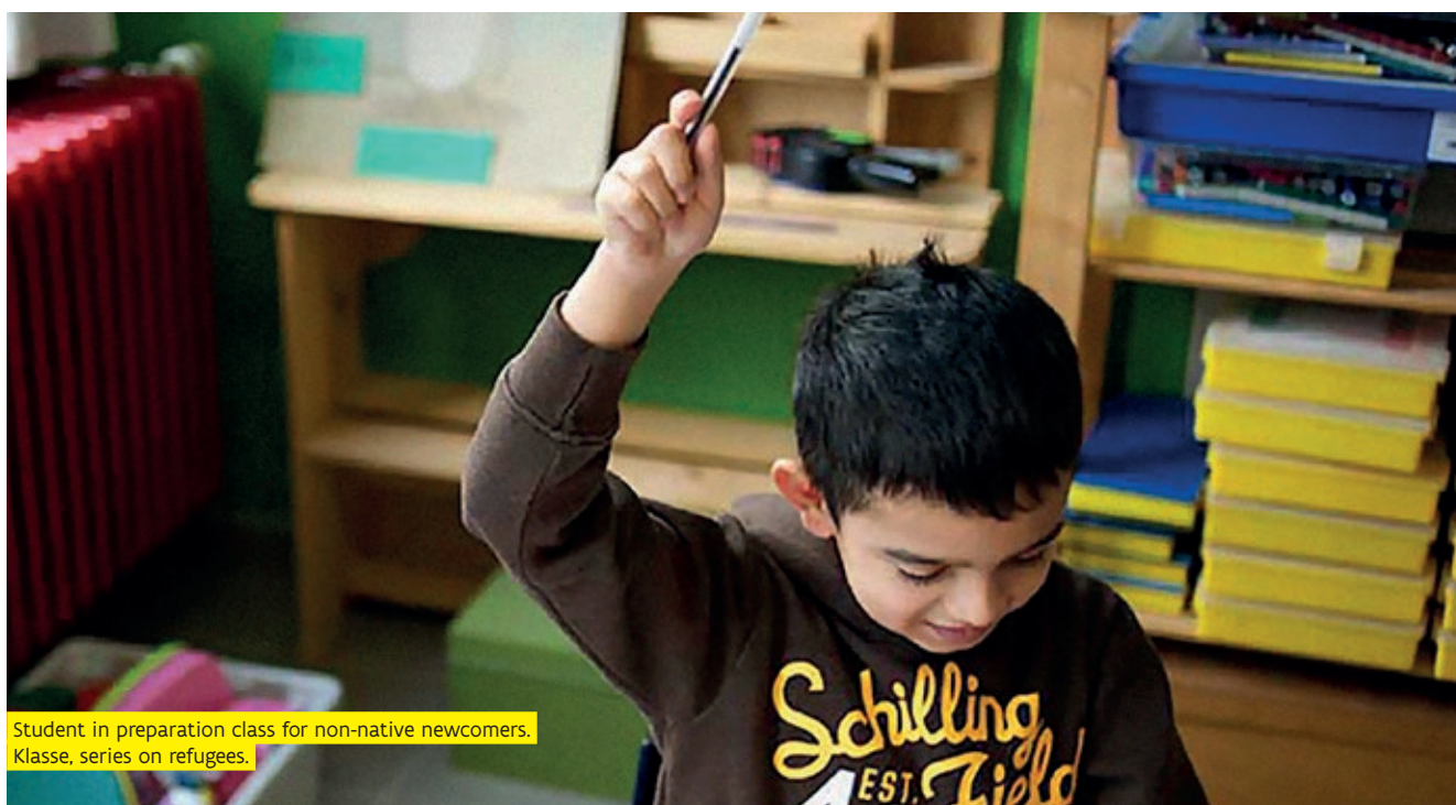
Student in preparation class for non-native newcomers. Klasse, series on refugees.

The Government of Flanders has therefore accepted its responsibility and has set up a Ministerial Committee for Refugees and the Asylum Crisis. Since refugees have been a target group within various policy areas for quite some time, the Government of Flanders has, first and foremost, focused on expanding the capacity of existing measures and instruments. In this way, Flanders has, among other things, provided additional funding for the increasing number of non-native speaking toddlers, additional reception classes for newly arrived non-native speakers and a better monitoring of pupils who, after their reception year, continue in the conventional education system. To increase the opportunities of refugees on the labour circuit, additional staff have been recruited for NARIC (National Academic Recognition Information Centre) Flanders. Within Welfare, special attention has been given to families with children and to unaccompanied foreign minors. This has been achieved, among other things, by providing, in partnership with Fedasil, 145 additional reception places for unaccompanied foreign minors (NBMV) in the asylum procedure, and by expanding the provision of supervised independent housing. Within Welfare, the focus is also on independent living supervision and additional budget has been freed up in the housing policy for rent allowances.