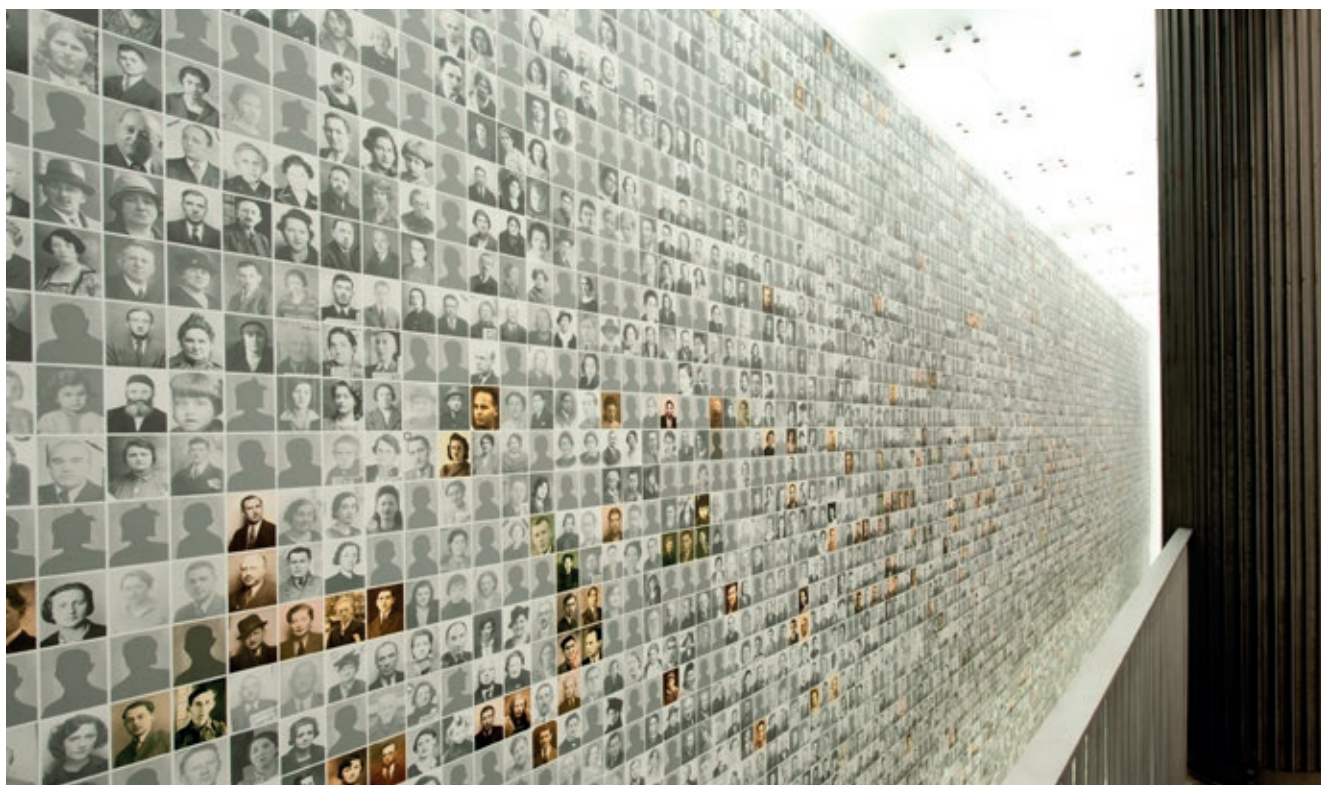
Part of the wall of portraits at the Kazerne Dossin. The wall, spread over 5 floors, contains 25.836 pictures of those deported from Dossin. Only those on a colour picture, survived deportation.

Finally, attention is paid to human rights in the context of professional education for staff of the Government of Flanders. In June 2016, the Agency for Government Personnel organised a training session on anti-discrimination for managers.